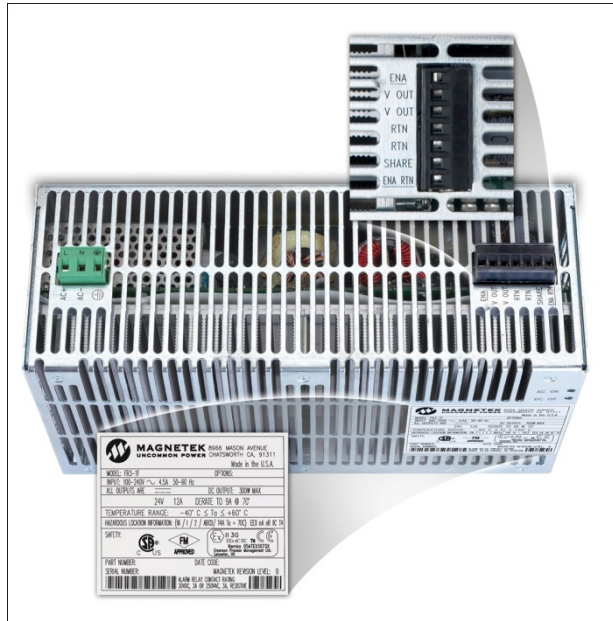
Bulk Power Supply illustrating wiring connections and electrical certifications.