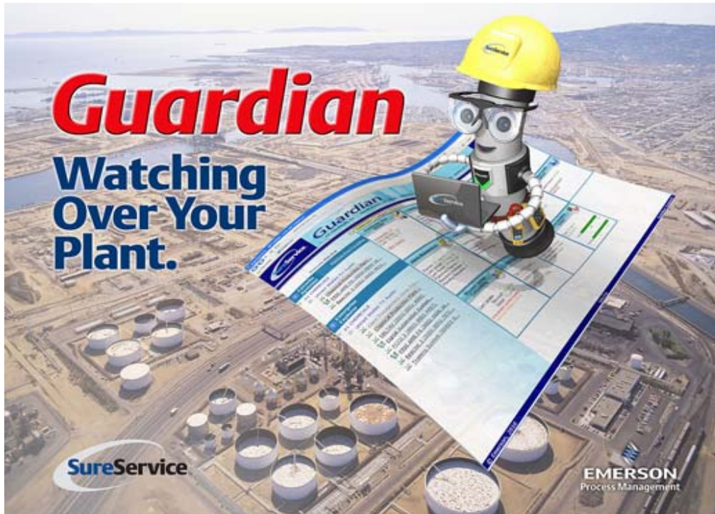
An innovative service for achieving peak availability, sustainability and performance of your DeltaV Digital Automation System.