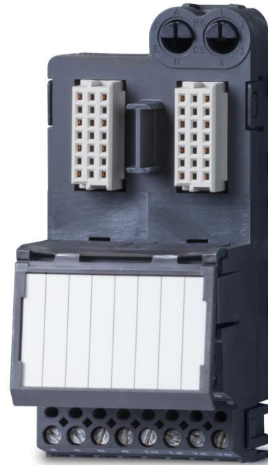
Traditional I/O terminal block.

Phased installation saves time. As soon as you mount the I/O interface carrier, you're ready to begin installing the field devices. I/O terminal blocks plug directly onto the I/O interface carrier. There is no need to have the I/O cards installed.