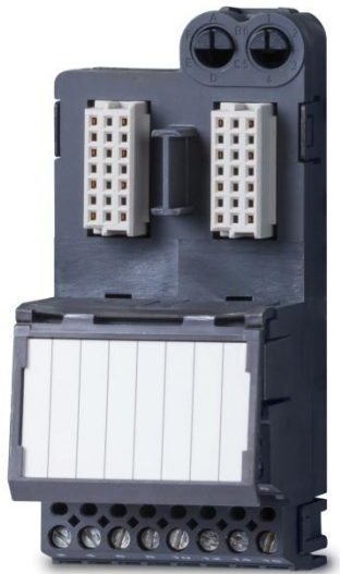
8 channel standard Terminal block

A variety of I/O terminal blocks are available to meet specific functionality and environmental requirements of the installation. The I/O interface is a combination of the I/O card and the I/O terminal block. Each I/O interface is uniquely keyed so that once installed in a carrier slot with a terminal block, that terminal block will only accept a replacement card.