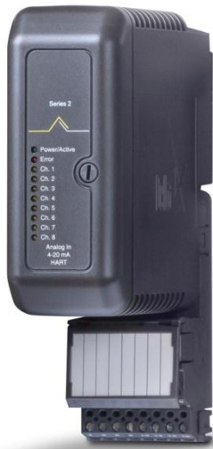
A Traditional I/O card easily plugs into an I/O carrier