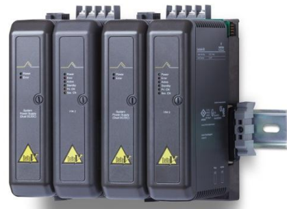
M-series VIM2 and power supply

Modular, flexible packaging. The VIM2 mounts in the same manner as the DeltaV controller. It mounts in the controller slot of a DeltaV 2-wide horizontal or 4-wide vertical carrier and uses a standard DeltaV Power Supply. The advanced design of the VIM2 will provide years of uninterrupted use.