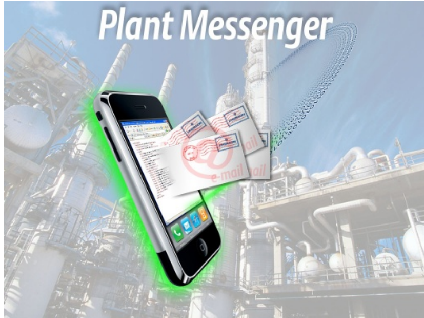
Plant Messenger delivers DeltaV™ system information when and where you want it.