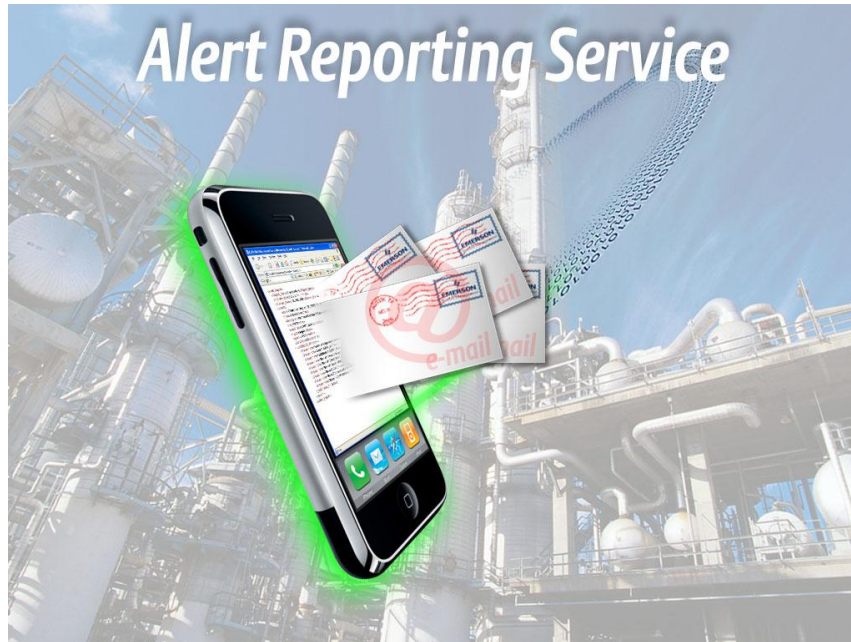
Plant Messenger delivers DeltaV™ alarms and events anywhere in the world.