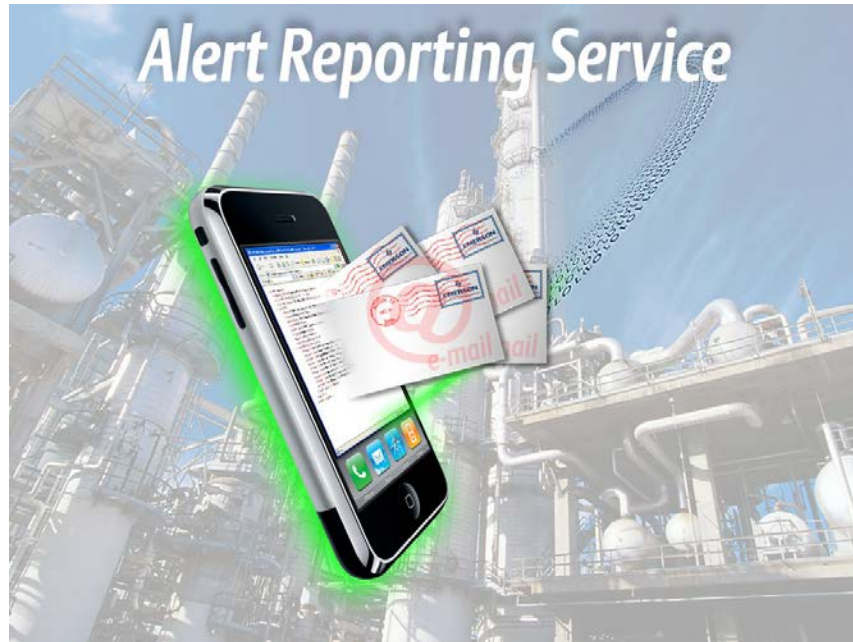
Plant Messenger delivers DeltaV™ alarms and events anywhere in the world.