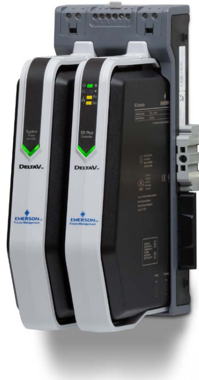
The SD Plus Controller

Field Proven Architecture. The S-Series controllers are an evolution of DeltaV M-Series hardware. The new design delivers installation and robustness enhancement while still using the same processor and OS that has proven itself in the field. All S-series I/O cards run the latest software enhancements of corresponding M-Series I/O cards and deliver the same field proven, reliable operation.