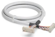
Terminal Assembly Base