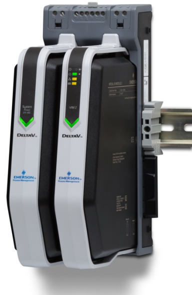
S-series VIM2 and power supply

Modular, flexible packaging. The VIM2 mounts in the same manner as the DeltaV controller. It mounts in the controller slot of a DeltaV 2-wide horizontal carrier and uses a standard DeltaV Power Supply. The advanced design of the VIM2 will provide years of uninterrupted use.