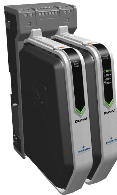
The SD Plus Controller

Field Proven Architecture. The S-Series controllers are an evolution of DeltaV M-Series hardware. The new design delivers installation and robustness enhancement while still using the same processor and OS that has proven itself in the field. All S-series I/O cards run the latest software enhancements of corresponding M-Series I/O cards and deliver the same field proven, reliable operation.