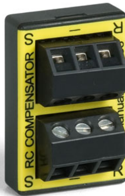
RC Compensator Module