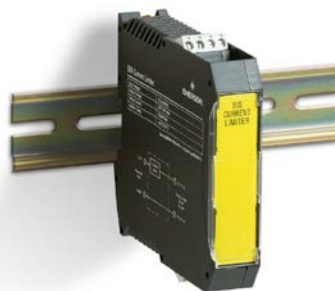
SIS Current Limiter