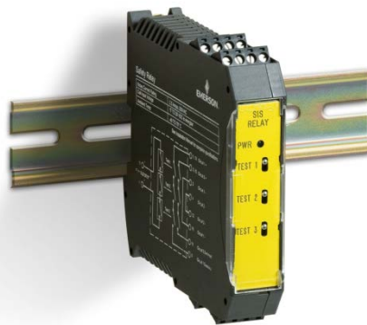
SIS Relay Module