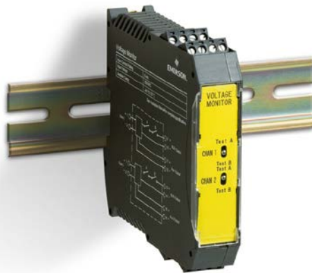
SIS Voltage Monitor