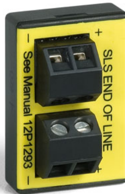
End of Line Resistance Module