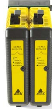
A redundant pair of SISnet Repeaters

Carrier Extender CTbles extend LocalBus power and signals between 8-wide carriers. Local peer bus extender cables extend the local peer bus (SISnet) between Logic Solvers on different carriers. 1-wide carriers with terminators terminate the local peer bus at the final carrier.