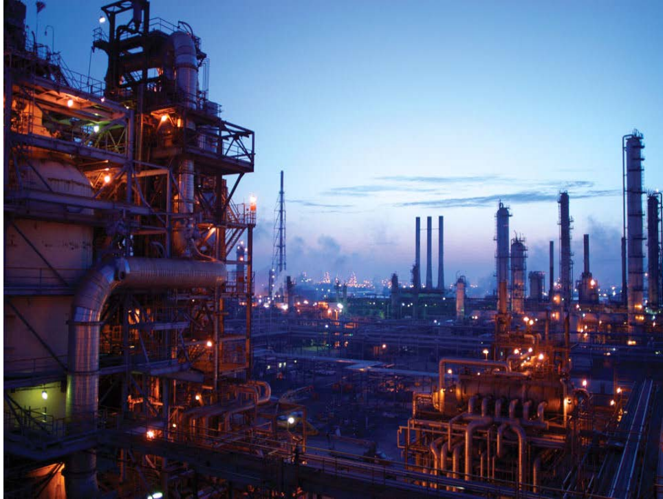
Multiple standalone DeltaV systems can now be connected via an Inter-Zone Network to provide unprecedented view and control of your entire plant.