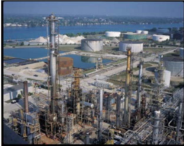
Large or geographically dispersed systems can benefit from the DeltaV Zones Architecture.

This new flexibility can provide better plant-wide control by providing the ability to access key information that was previously unavailable or too costly/difficult to implement.