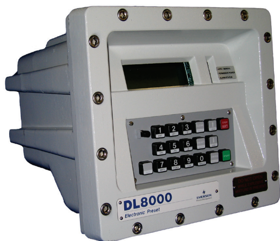
DL8000 Preset (Class I, Zone 1 Version)