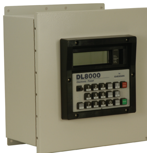
DL8000 Preset (Class I, Div. 2 Version)