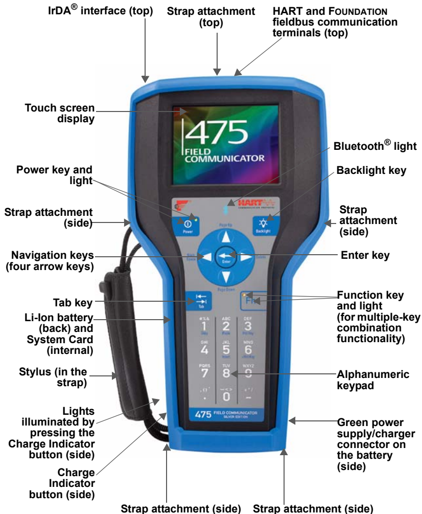
Figure 1. 475 Field Communicator with the Protective Rubber Boot